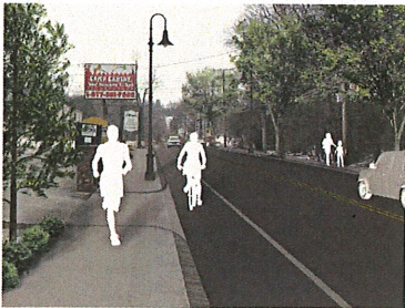
EXISTING STREET AND PROPOSED BIKE/PEDESTRIAN WAY - A COMPLETE STREET