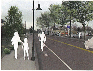
EXISTING VIEWS ON THE CORRIDOR AND PROPOSED, IMPROVED CORRIDOR