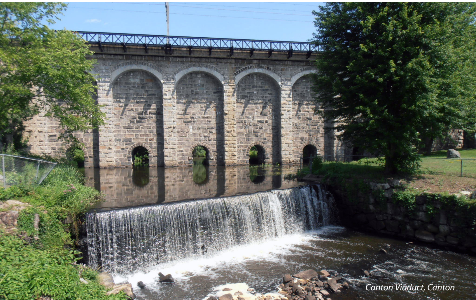
Canton Viaduct, Canton

HSIP = Highway Safety Improvement Program. MassDOT = Massachusetts Department of Transportation. MPO = metropolitan planning organization.