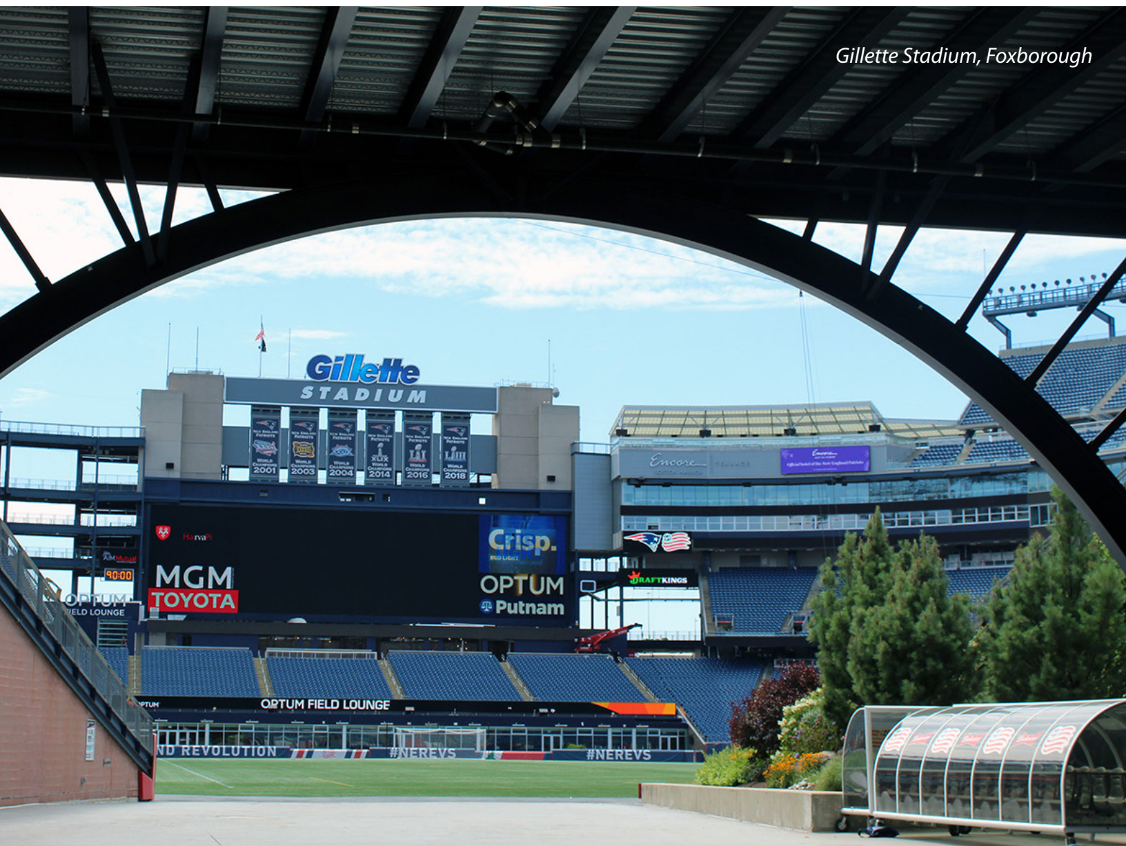
Gillette Stadium, Foxborough