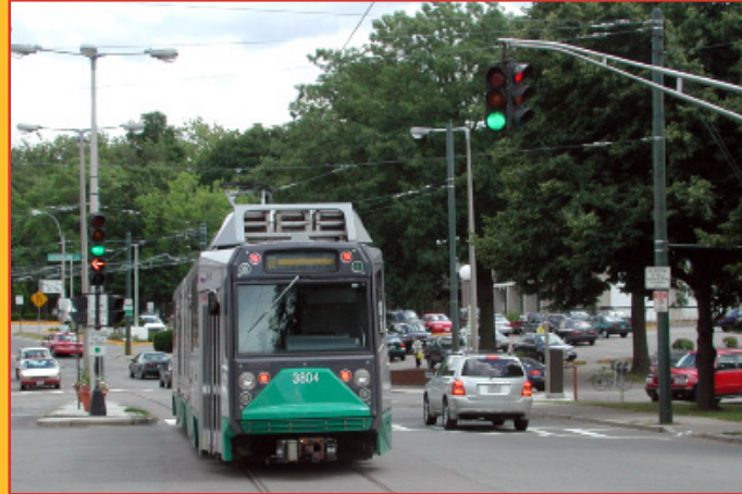
Transit Signal Priority Guidebook

The Boston Region MPO envisions a modern, well-maintained transportation system that supports a sustainable, healthy, livable, and economically vibrant region. To achieve this vision, the transportation system must be safe and resilient; incorporate emerging technologies; and provide equitable access, excellent mobility, and varied transportation options.