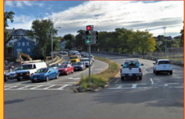
Route 16 Priority Corridor Study, Chelsea and Everett, Massachusetts