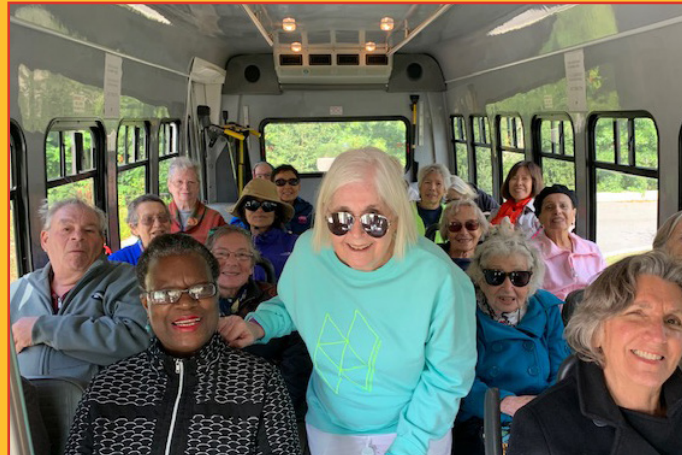
Operating a Successful Community Shuttle Program Guidebook