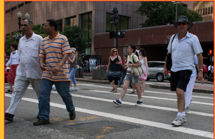
Pedestrian Report Card Assessment Interactive Database

Past studies are available in our Publications Archive .