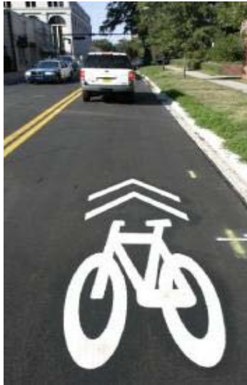
Figure 2 Example of “Sharrow” Pavement Marking

The Everett Avenue/Cross Street intersection had five crashes involving pedestrians from 2006 to 2008. Although these short-term improvements would not be as effective as the proposed traffic/pedestrian signal system, they would potentially improve the safety of the two intersections by reducing the conflicts between motorists and non-motorists. Not including the proposed pedestrian bulb-out, they should cost about several thousand dollars and could be implemented in a relatively short time. They are also compatible with the future signal system.