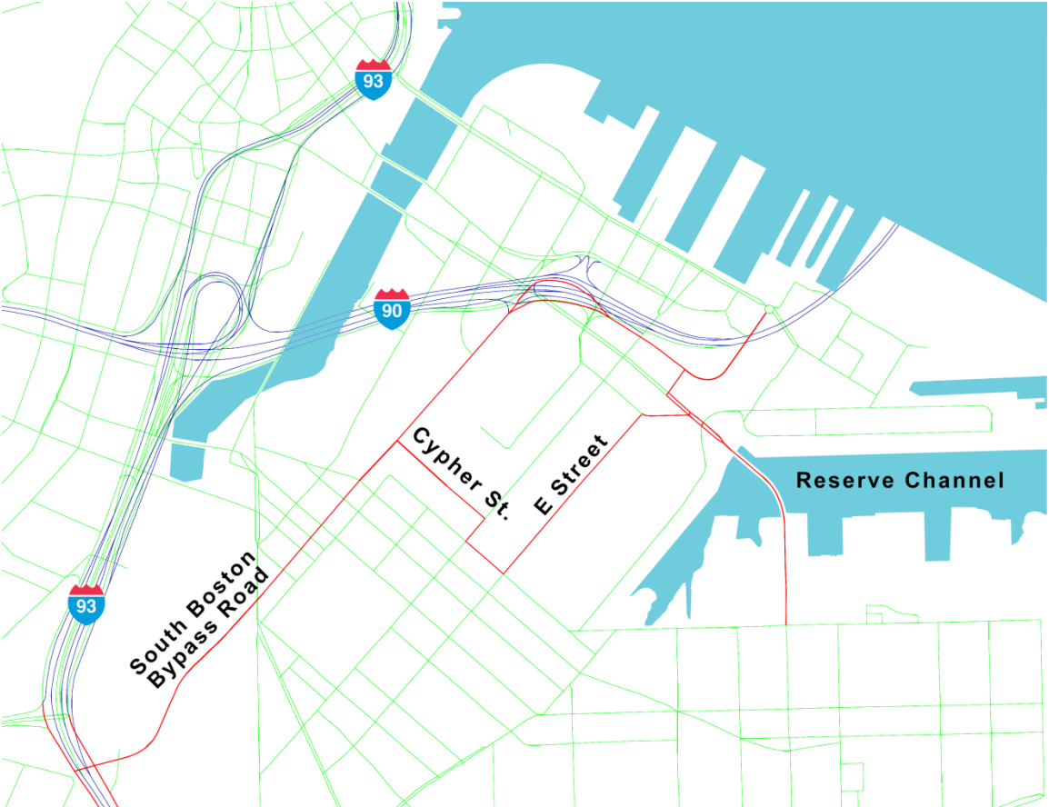
Figure 4 South Boston Waterfront

Red: Recently adopted Critical Urban Freight Corridors Purple: Previously defined National Highway Freight Network elements Green: Other MPO travel demand model roadways