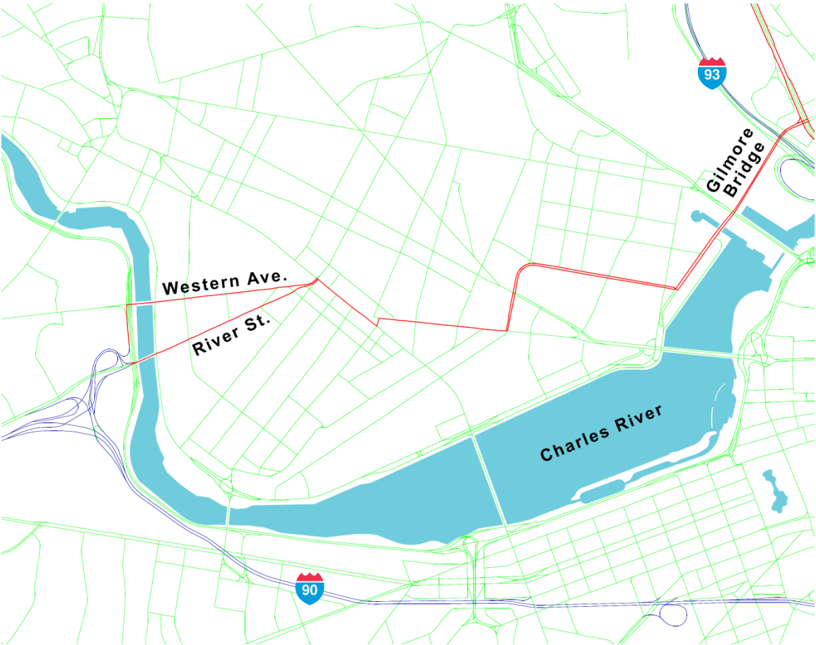
Figure 3 Charlestown to the Turnpike

Red: Recently adopted Critical Urban Freight Corridors Purple: Previously defined National Highway Freight Network elements Green: Other MPO travel demand model roadways