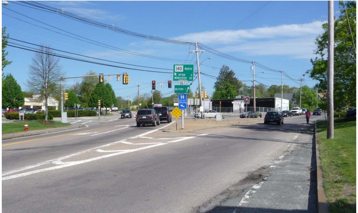
FIGURE 2 South Main Street Northbound Approach