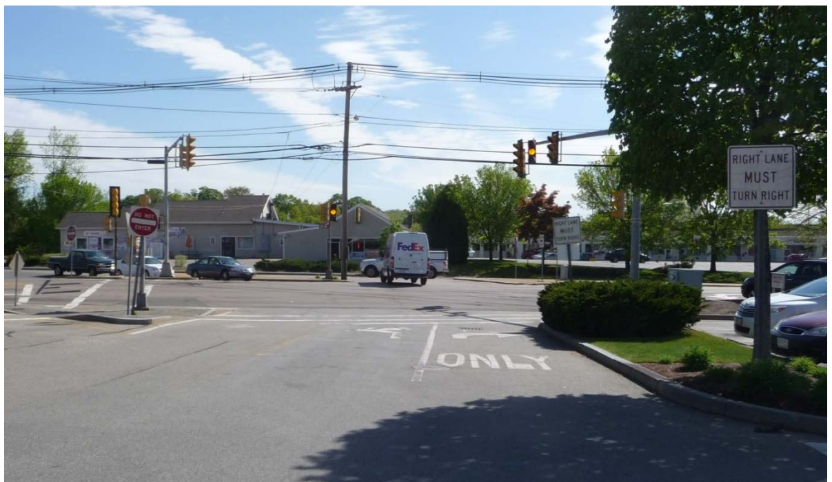
FIGURE 3 CVS Driveway at the Intersection of Route 140 and South Main Street