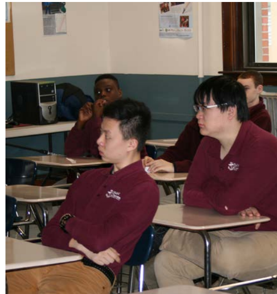
Students at St. Clement School watch a presentation about a recent transportation study in Everett and Chelsea.

He also pointed out that the St. Clement School students will have more opportunities in their own neighborhood in coming weeks to learn from other transportation professionals, listen to public testimony, and voice their own opinions at upcoming public meetings about the about the Green Line Extension project. (See the Calendar section for upcoming meeting schedules.)