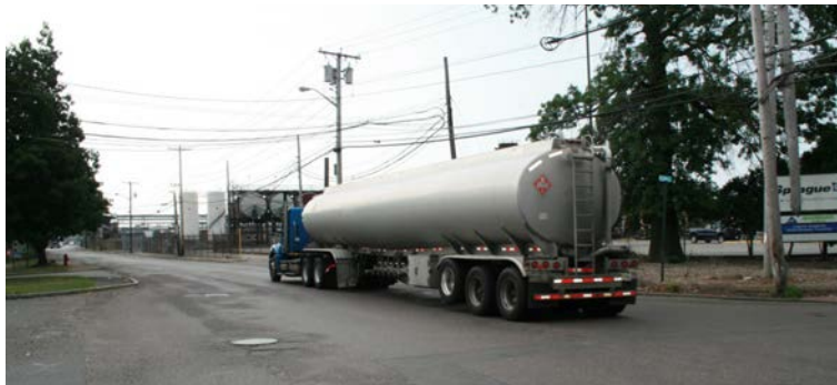
A tank truck carries gasoline past an asphalt plant on Beacham Street in Chelsea.

The report, Improving Truck Travel in the Everett-Chelsea Industrial Area , is available on the MPO's website, www.bostonmpo.org .