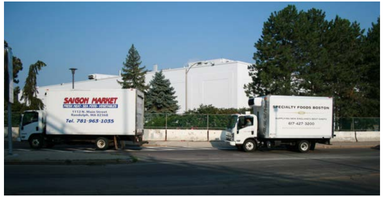
Refrigerated distribution trucks near the Kayem Foods meat packing plant near the Tobin Bridge on-ramp in Chelsea.

Large numbers of trucks also serve the energy and petroleum industries. Numerous tank trucks containing gasoline, diesel fuel, heating oil, liquefied natural gas, and asphalt are seen on roads throughout the study area. Many serve locations in