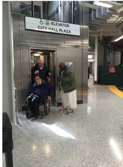
The newly accessible Government Center Station

The SWA will be updating AACT on the status of its initiatives periodically throughout the year.