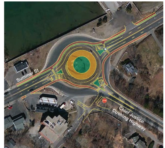
An MPO study has proposed two alternatives for replacing the Route 3A rotary in Hingham. The overlays above show the layout of a proposed signalized intersection (left) and a modern roundabout (right) over the existing rotary.

The members of the Boston Region MPO: Massachusetts Department of Transportation, Cities of Beverly, Boston, Everett, Newton, Somerville, and Woburn, Federal Highway Administration, Federal Transit Administration, Massachusetts Bay Transportation Authority, Massachusetts Bay Transportation Authority Advisory Board, Massachusetts Port Authority, Metropolitan Area Planning Council, Regional Transportation Advisory Council, Towns of Arlington, Bedford, Braintree, Framingham, Lexington, Medway, and Norwood